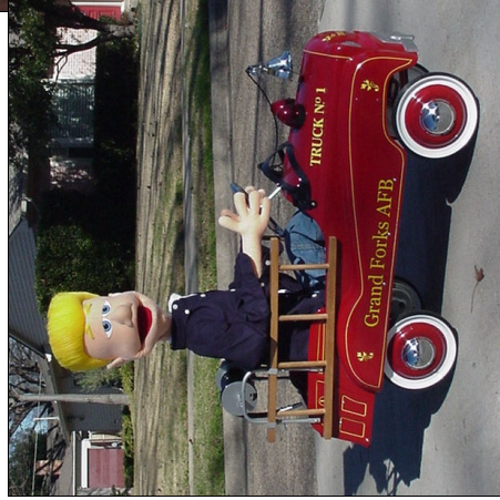
Max and a Comet Fire Engine

All fire vehicles come equipped with sirens, seatbelts and flashing lights.